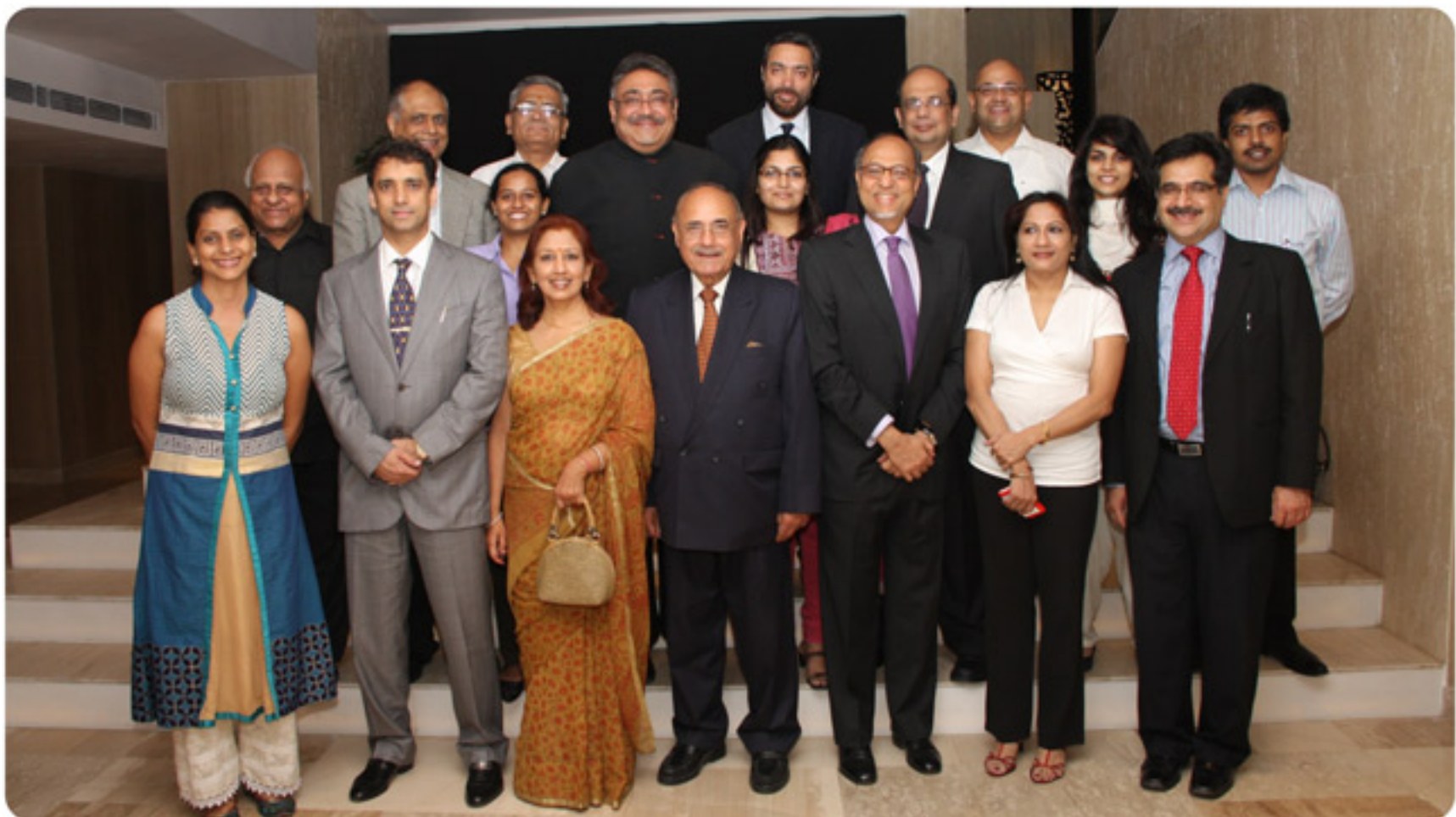
Some members of the Host Committee IPBA 2012 New Delhi

The Taj Palace Hotel, New Delhi is a flagship hotel of the world renowned Taj Group of Hotels, Resorts & Palaces. The hotel has played host to heads of states, corporate big shots and high profile businessmen from across the world. One can enjoy the warmth of traditional Indian hospitality with all the modern world-class comforts and luxury. It has a Convention Centre that can accommodate over 1000 delegates in a single pillar-less hall. Equipped with wireless broadband Internet access, the hotel offers world class conference services. Its recreational facilities include several gourmet restaurants, lively bars, a swimming pool, spa, golf, tennis and shopping facilities and so on.