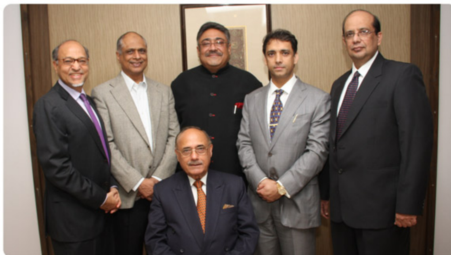
Core Group IPBA 2012